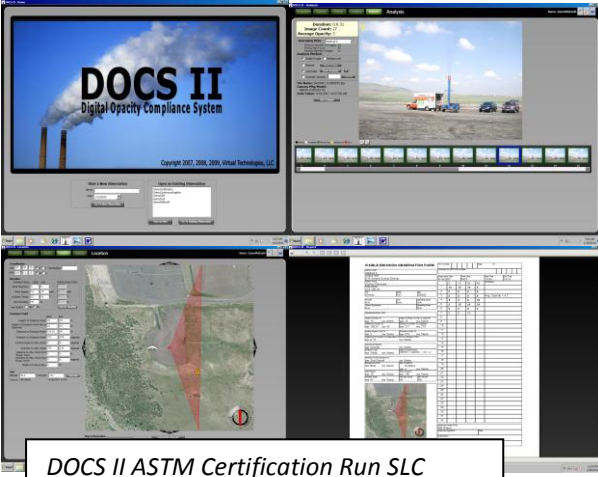
DOCS II ASTM Certification Run SLC

The DOCS project was initiated by the Department of Defense in 2003, with a goal of reducing the $15 million per year the DoD spends certifying human Method 9 observers to observe sources regulated with opacity limits. In 2006, VTLLC was contracted to test and validate the DOCS prototype system. Upon completion of the validation tests the USAF decided that the DOCS system required a technology refresh and business process improvement. VTLLC, working with multiple state inspectors, defined the user experience required to gain acceptance from visible emission observers.