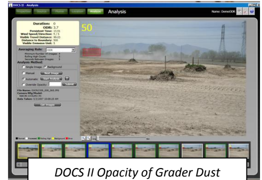
DOCS II Opacity of Grader Dust

VTLLC partnered with the nation's largest smoke school operator "Eastern Technical Associates" to train and distribute DOCS II.